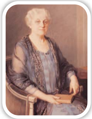
▲ Carrie Chapman Catt

By the time Wilson began his campaign for a second term in 1916, the NAWSA's president, Carrie Chapman Catt , saw victory on the horizon. Catt expressed her optimism in a letter to her friend Maud Wood Park.