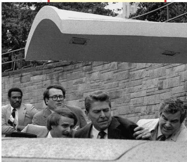
▲ President Reagan is pushed into a presidential limousine after being shot by a deranged man.

On March 30, 1981, President Reagan and other members of his staff were shot by a mentally unbalanced man named John Hinckley, Jr. While being wheeled into surgery to have a bullet removed, the president said to his wife, “Honey, I forgot to duck” (a line first used by boxer Jack Dempsey in the 1920s, after being knocked out in a bout). In the operating room, Reagan said to the team of surgeons, “I hope you fellas are Republicans.” Reagan recovered speedily and his popularity grew.