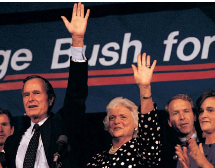
◀ George Bush announces his presidential candidacy at a rally in 1987.