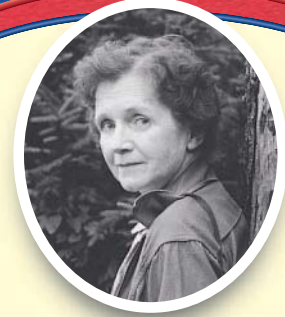
RACHEL CARSON 1907–1964

The marine biologist Rachel Carson was born far from the sea, in the small town of Springdale, Pennsylvania.