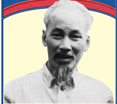
HO CHI MINH 1890–1969

Born Nguyen Tat Thanh to a poor Vietnamese family, Ho Chi Minh (which means "He Who Enlightens") found work as a cook on a French steamship. This allowed him to visit such cities as Boston and New York.