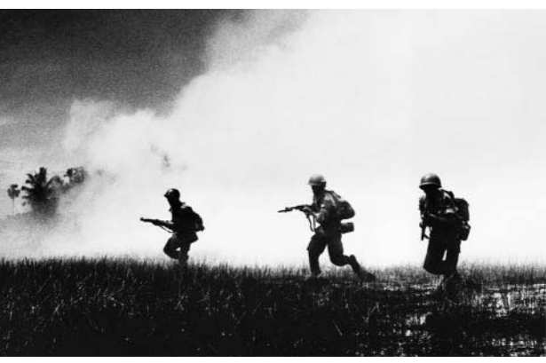
The swampy terrain of South Vietnam made for difficult and dangerous fighting. This 1961 photograph shows South Vietnamese Army troops in combat operations against Vietcong guerrillas.