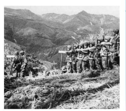
After parachuting into the mountains north of Dien Bien Phu, South Vietnamese troops await orders from French officers in 1953.