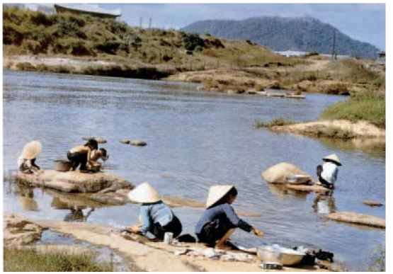
Rivers serve as places to bathe and wash clothing.