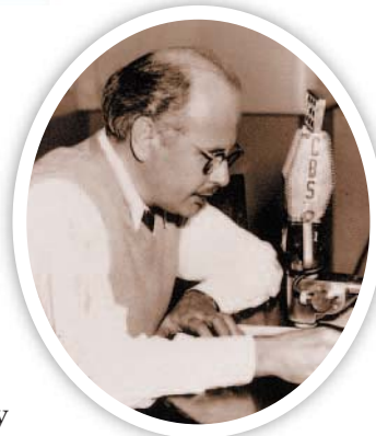
▲ William Shirer, a journalist and historian, became well known for his radio broadcasts from Berlin at the beginning of World War II.

In 1940, CBS correspondent William Shirer stood in the forest near Compiègne, where 22 years earlier defeated German generals had signed the armistice ending World War I. Shirer was now waiting for Adolf Hitler to deliver his armistice terms to a defeated France. He watched as Hitler walked up to the monument and slowly read the inscription: "Here on the eleventh of November 1918 succumbed the criminal pride of the German empire . . . vanquished by the free peoples which it tried to enslave." Later that day, Shirer wrote a diary entry describing the führer's reaction.