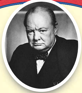
WINSTON CHURCHILL 1874–1965

Churchill was possibly Britain's greatest weapon as that nation faced the Nazis. A born fighter, Churchill became prime minister in May 1940 and used his gift as a speaker to arouse Britons and unite them: