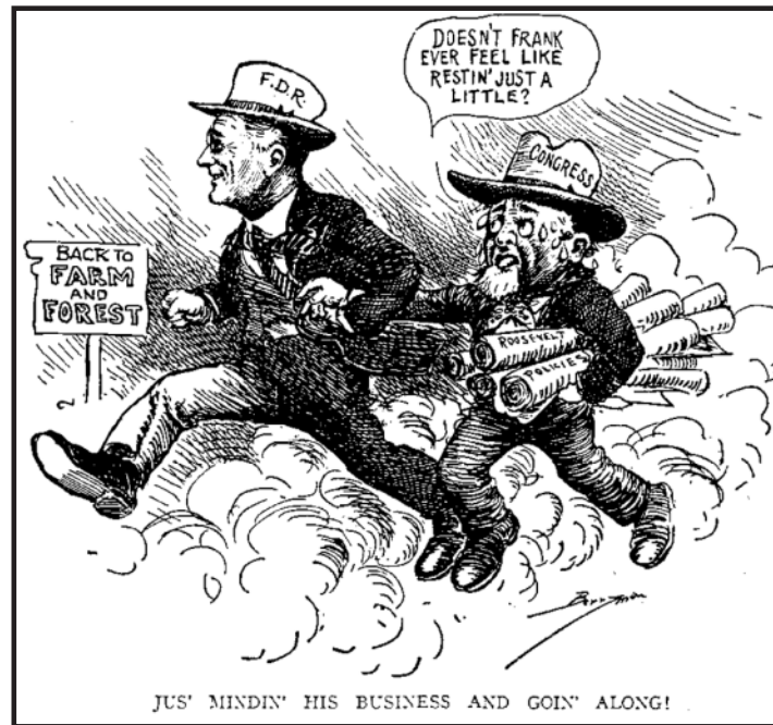
▲ This 1933 cartoon depicts Roosevelt exhausting Congress with his many reform policies.

The New Deal legacy has many dimensions. It brought hope and gratitude from some people for the benefits and protections they received. It also brought anger and criticism from those who believed that it took more of their money in taxes and curtailed their freedom through increased government regulations. The deficit spending necessary to fund New Deal programs grew immensely as the nation entered World War II.