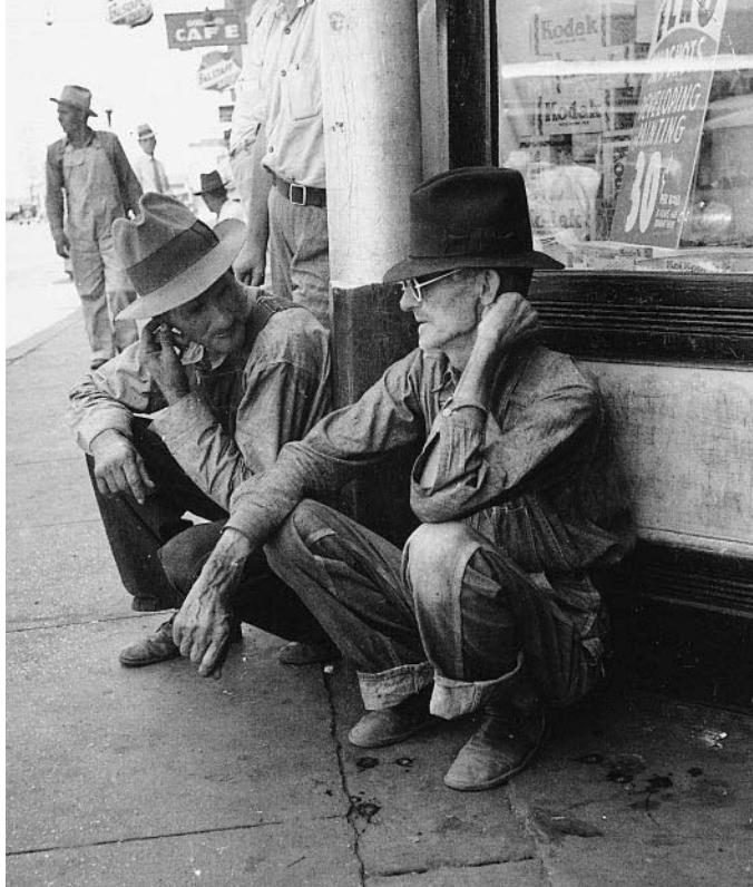
▲ Unemployed workers sit on a street in a 1936 photograph by Dorothea Lange.

The federal government had to go deeply into debt to provide jobs and aid to the American people. The federal deficit increased to $2.9 billion in fiscal year 1934. As a result of the cutbacks in federal spending made in 1937–1938, the deficit dropped to $100 million. But the next year it rose again, to $2.9 billion. What really ended the Depression, however, was the massive amount of spending by the federal government for guns, tanks, ships, airplanes, and all the other equipment and supplies the country needed for the World War II effort. During the war, the deficit reached a high of about $54.5 billion in 1943.