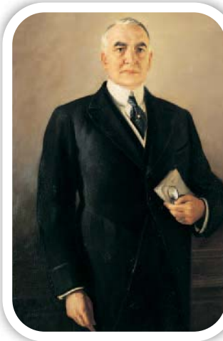
▲ Warren G. Harding, shown here in 1923, is considered one of the least successful presidents.

Despite Harding’s soothing speeches, his judgment turned out to be poor. The discord among the major world powers and the conduct within his own cabinet would test his politics and his character.