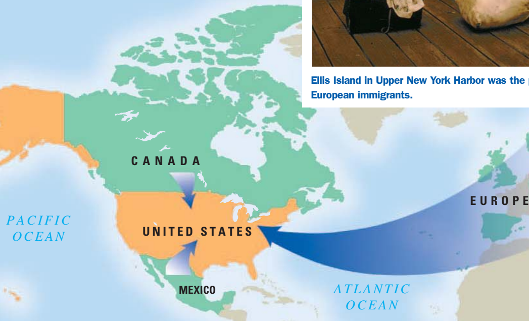
Immigration to the United States, 1921 and 1929