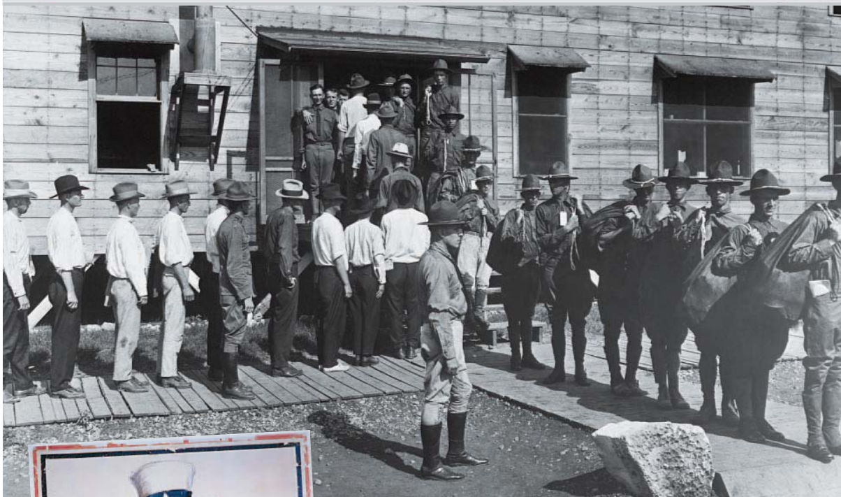
◀ Drafted men line up for service at Camp Travis in San Antonio, Texas, around 1917.