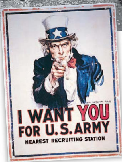
▲ James Montgomery Flagg's portrayal of Uncle Sam became the most famous recruiting poster in American history.

RAISING AN ARMY To meet the government's need for more fighting power, Congress passed the Selective Service Act in May 1917. The act required men to register with the government in order to be randomly selected for military service. By the end of 1918, 24 million men had registered under the act. Of this number, almost 3 million were called up. About 2 million troops reached Europe before the truce was signed, and three-fourths of them saw actual combat. Most of the inductees had not attended high school, and about one in five was foreign-born.